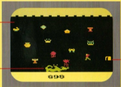
In The Treasure Room